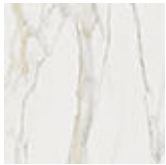
OD05 matt Golden Calacatta