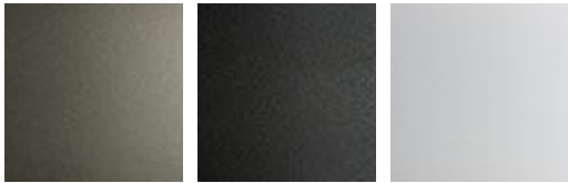
GFM11 titanium embossed